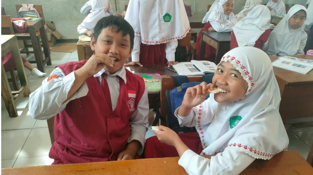
Figure 5 Giving a Reward for Students

On October 19 th , the writer and her friend were teaching grade four A the material that is about My Living Room is Beside the Kitchen (Figure 5). This material was very slow and tough to move on to the next one because the majority of the students could not understand and focus on us. We tried our best to teach them, and eventually we succeeded with playing guessing games and many more English games so that they were not bored learning English. We found the strategic way is to lure the students to be more active by giving them some kind of reward.