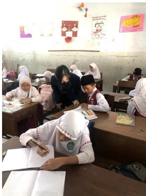
Figure 4 Teaching Grade Five