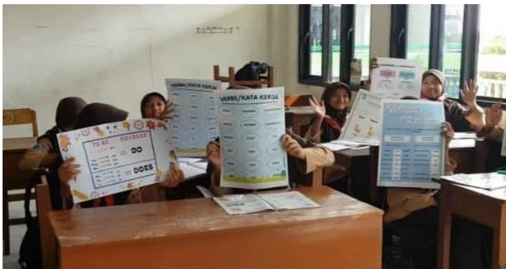
Figure 6 Posters of Daily Verbs

On November 4 th 2023, Ma'am Dian asked the writer and all her friends to make posters of Daily Verbs, Comparison, Possessive Adjectives + Possessive Pronouns, Adjectives, and Daily Conversation (Figure 6). All of us started to discuss how to divide the works and who would work on what. The writer chose the daily verbs to work on them. The deadline was on November 14 th , so we submitted it on the 13 th of November.