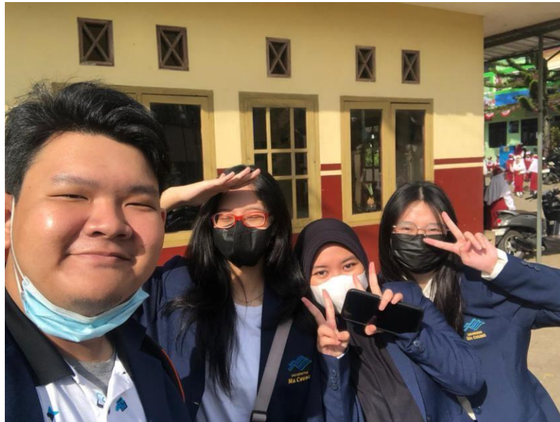
Figure 3 Independence Day Ceremony

On August 17 th 2023, there was an activity at MI Wahid Hasyim 02 Dau which is the Independence Day Ceremony, in which the writer and her friends also participated (Figure 3). We arrived at the MTS around 6.50 AM, and the ceremony started at 7 AM. The ceremony was held at the MTS because the school could accommodate a lot more students and teachers than the MI. Of course, Independence Day is very important to us Indonesians, but the ceremony was nothing out of the ordinary except there was one event that startled us because we had not experienced that event before. It was when there were sirens going off and there were fireworks in broad daylight.