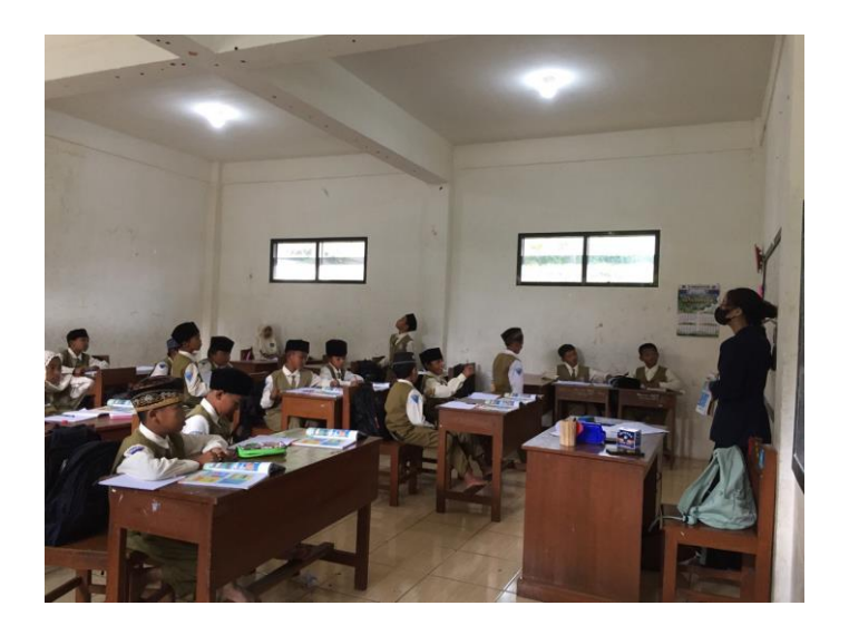
Figure 6. Teaching and learning process in class 4C