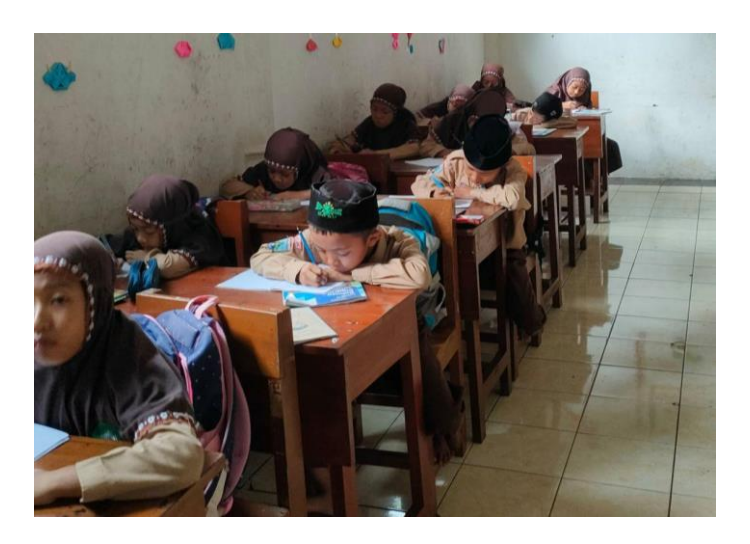
Figure 9. Teaching and learning activities in class 3A