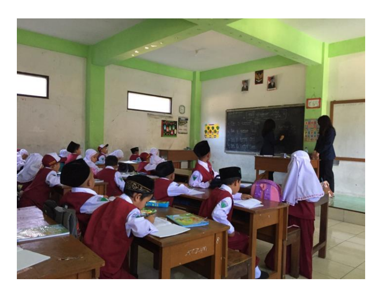
Figure 2. Teaching in grade 1

As seen in the figure 2, friends and I were frequently asked to take the English teacher's job in grades 1-2 during my internship. It's not as hard to teach grades 1 and 2 as it is in other upper grades, even though it does require some adaptation and a different method. I was also asked to teach grade 7 at MTS Wachid Hasyim 02 Dau, along with my friends. At first, we were able to teach 7th grade, but due to several schedules colliding, we only taught at MI Wachid Hasyim 02 Dau.