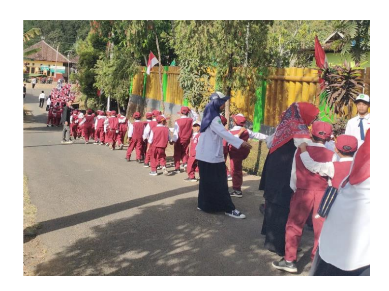
Figure 5. Organizing MI students

On August 17, 2023, my friends and I were asked to attend and participate in the flag ceremony at MTS Wachid Hayim 02 Dau, which is not far from MI Wachid Hasyim 02 Dau. My friends and I helped in organizing the return of MI students to MI after the flag ceremony there.