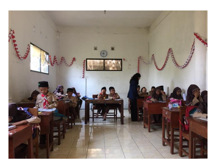
Figure 7. Assessment in class 3A

By October, I was getting used to teaching and adapting to the job of a teacher. In addition, I took many assessments to see the extent of students' understanding and the success